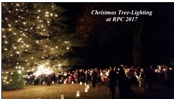
Christmas Tree-Lighting at RPC 2017