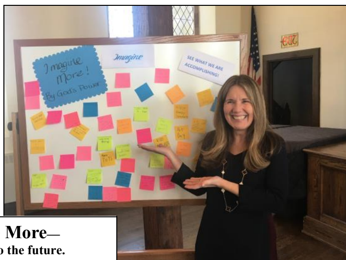
Imagine More— RPC looks to the future.