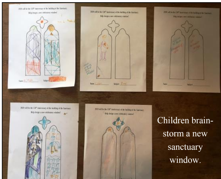
Children brainstorm a new sanctuary window.